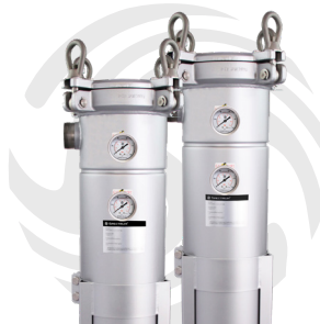
Premier Size 1&2