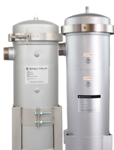
Standard Size 1&2