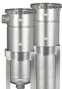
Standard Size 3&4

The below products have often been associated with this product.